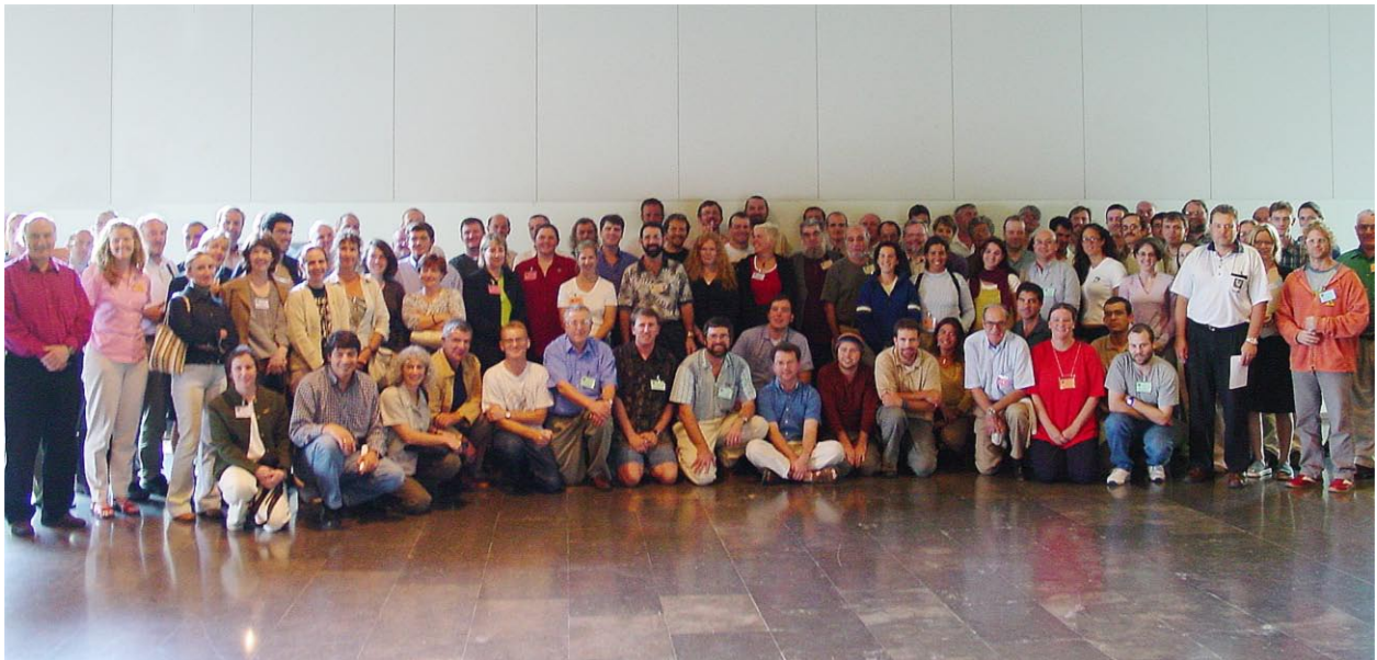
Participants of the Symposium on Elasmobranch Fisheries: Managing for Sustainable Use and Biodiversity Conservation , 11–13 September 2002.