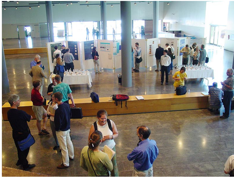
Participants at Poster Presentations