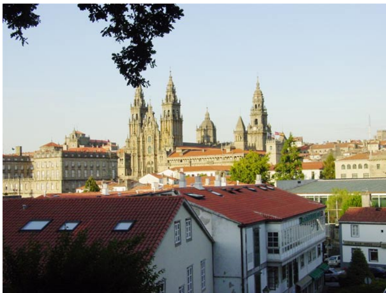
Santiago de Compostela, Galicia, Spain