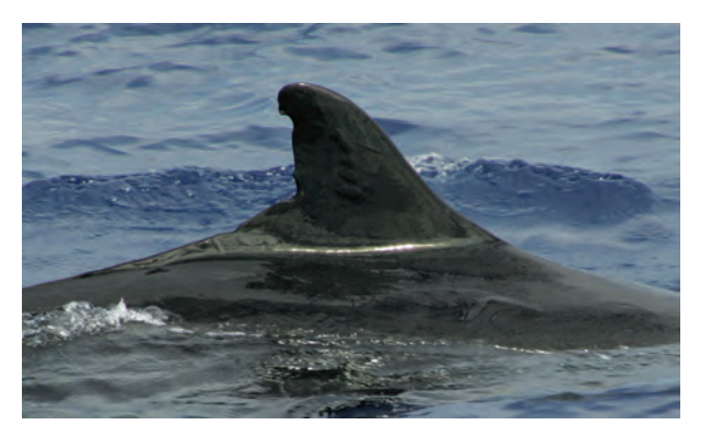
Fig. 3a. False killer whale dorsal fin. Twelve unique individuals were documented through nicks, notches and scars on the dorsal fins, such as seen here.

Much of what is known about offshore ecotype bottlenose dolphins has been determined from stranded animals (e.g., Hersh and Duffield, 1990; Mead and Potter, 1995), which does not allow for description of their coloration patterns. The coastal and offshore ecotypes (treated as separate management units under the US Marine Mammal Protection Act of 1972) are described as genetically separable, partially sympatric, but visually indistinguishable (Waring et al., 2001; Torres et al., 2005). In our study, we were able to document bottlenose dolphins with white saddle markings on the peduncles of the larger, more robust individuals. This could be a useful marker for identifying the ecotypes at sea and through photographs. However, due to the opportunistic nature of our study, it is unknown if this trait is common to all individuals of the offshore ecotype or if it is limited solely to the offshore ecotype. It is also possible that this feature is limited to animals in our study area, because the study that documented differences in western North Atlantic ecotypes (Torres et al., 2003) did not include waters south of Central FL. More research combining morphological,