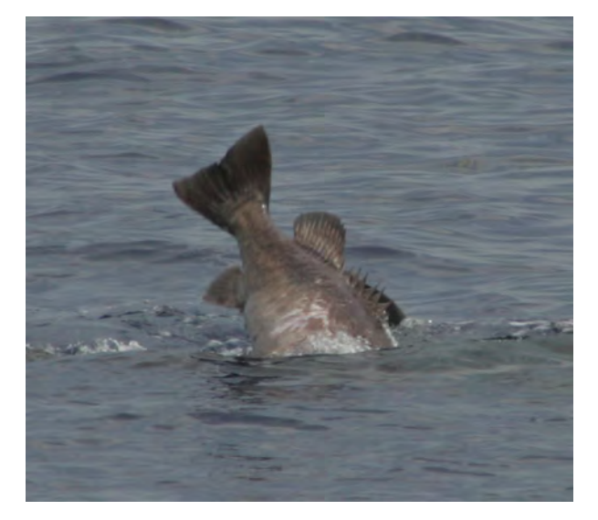
Fig. 3c. Large demersal fish species, from the Serranidae family, brought to the surface shortly before being eaten by false killer whales. Only the gills remained after feeding.