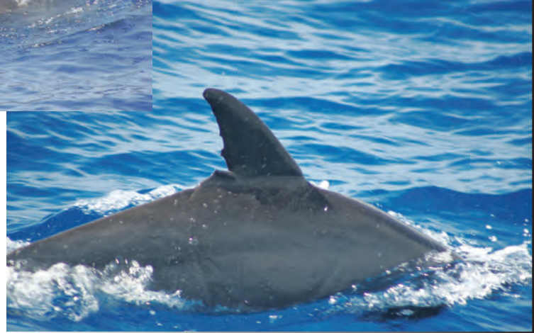
Fig. 2b. Coastal ecotype bottlenose dolphin without white saddle patch sighted on Little Bahama Bank. This individual is part of a long-term resident population; to date no identified individual (over 300 documented) in this population has the white saddle marking seen on the offshore individuals.

May 2016, only three of the nine species we observed have been documented by other research groups in our study area: the short-finned pilot whale (Dunn 2006; Halpin, 2009), sperm whale (Woolmer 2013; Halpin et al., 2009) and bottlenose dolphin (Garrison, 2013b; Josephson and Garrison, 2015a, 2015b). The other five species we observed (beaked whales were not considered for this comparison because we could not identify them to the species level) have only been seen to the north, east and/or south of our study area: Fraser's dolphin (Dunn, 2013b), false killer whale (Garrison, 2013a; Dunn, 2013b), pantropical spotted dolphin (Hyrenbach et al 2012; Dunn, 2013a; 2013b), Risso's dolphins (Dunn, 2013b), and Atlantic spotted dolphin (Garrison, 2013c; Dunn, 2013a, 2013b; Josephson and Garrison, 2015b.). It is important to note that each of the nine species we observed have stocks designated by NMFS in both the western North Atlantic and the northern Gulf of Mexico, and that the individuals we observed off southeast FL may be from either or both of these regions. Our results indicate that the ranges of the nine species we observed may extend south of north/central FL, or may indicate movement from the Gulf of Mexico, at least seasonally. In addition, for the false killer whale, Fraser's dolphin, pantropical spotted dolphin, Risso's dolphin, Atlantic spotted dolphin and beaked whale, our sightings are the first known sightings in southeast FL waters. Thus, the opportunistic sightings