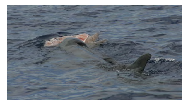
Fig. 3b. A false killer whale feeding on large, bloated demersal fish species brought to the surface.