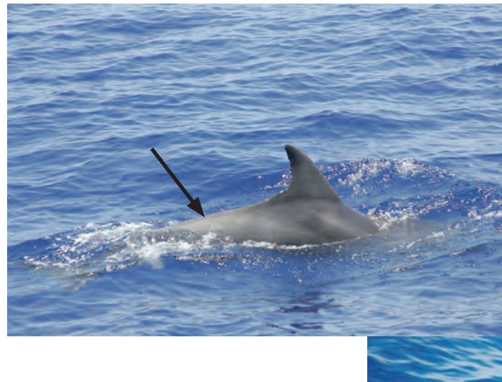
Fig. 2a. Offshore ecotype bottlenose dolphin sighted in the Gulf Stream off the southeast coast of Florida (June 3 2010.) Arrow indicates white saddle patch. Photographer: Cindy Elliser, Wild Dolphin Project.

Fig. 2b. Coastal ecotype bottlenose dolphin without white saddle patch sighted on Little Bahama Bank. This individual is part of a long-term resident population; to date no identified individual (over 300 documented) in this population has the white saddle marking seen on the offshore individuals. Photographer: Cindy Elliser, Wild Dolphin Project.