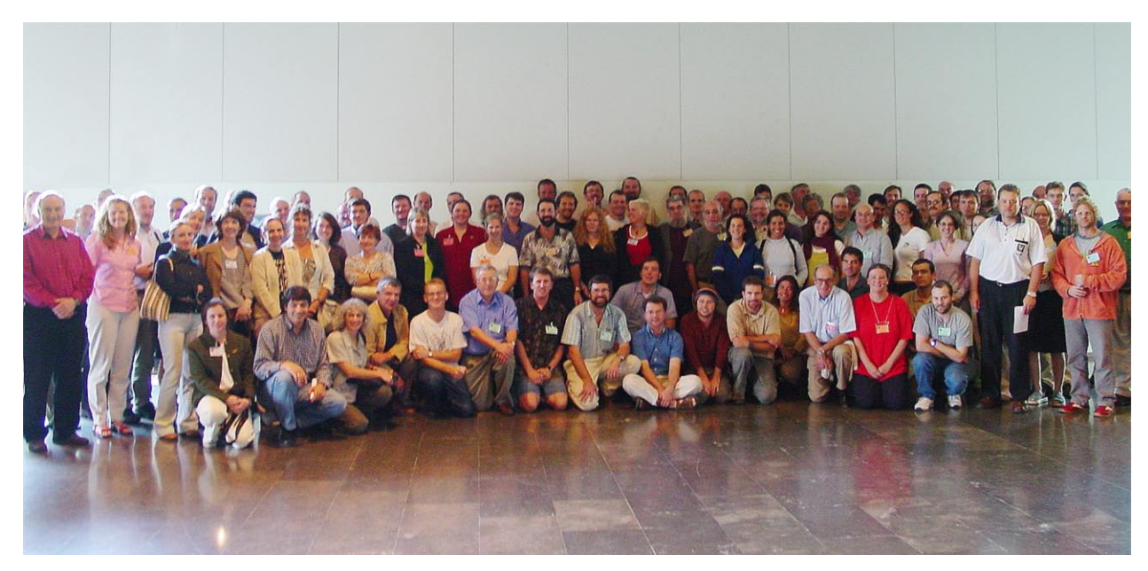
Participants of the Symposium on Elasmobranch Fisheries: Managing for Sustainable Use and Biodiversity Conservation , 11–13 September 2002.