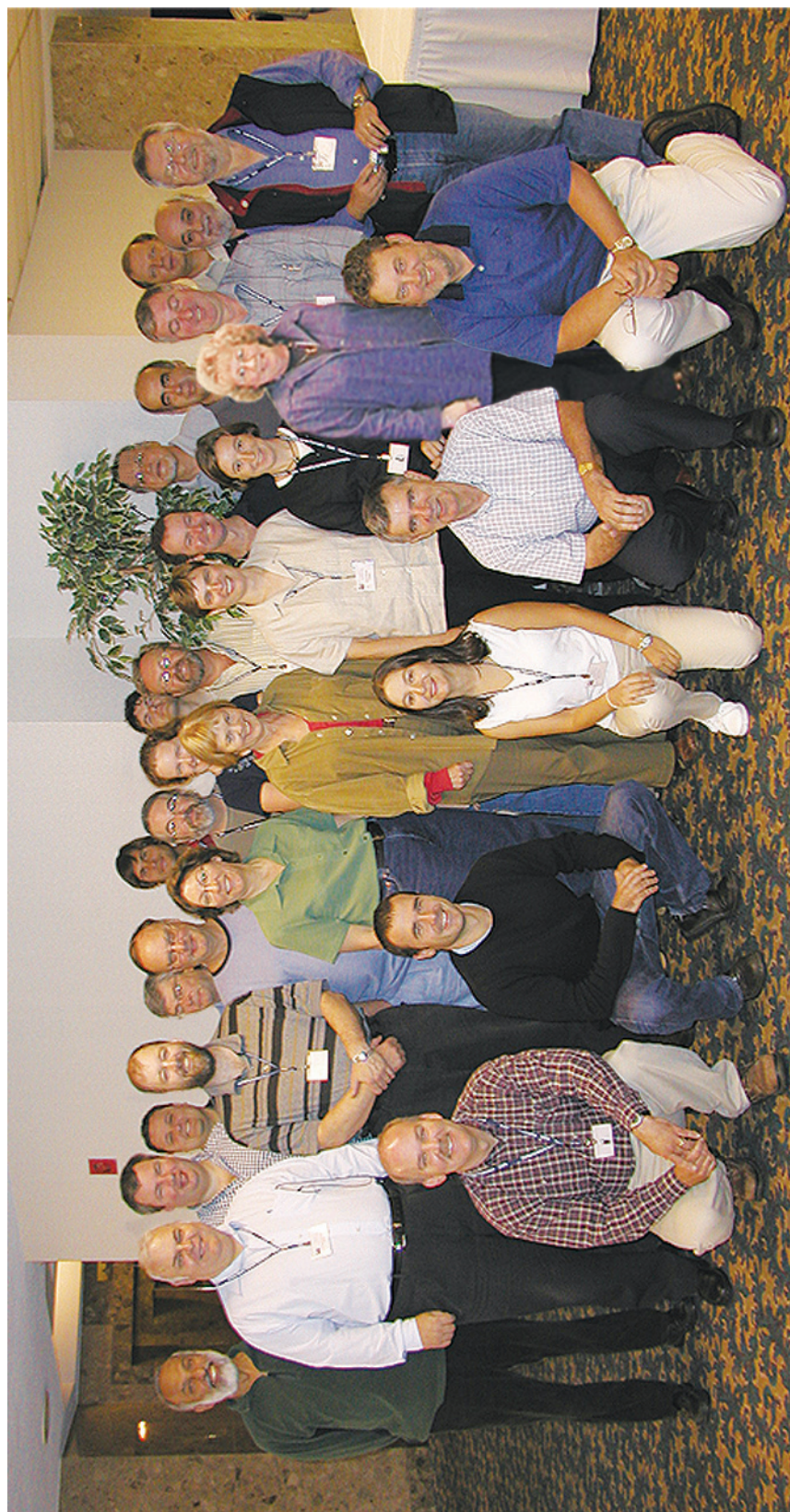
Participants of Symposium on "The Ecosystem of the Flenish Cap" held at the Holiday Inn Harbourview during 8-10 September 2004.